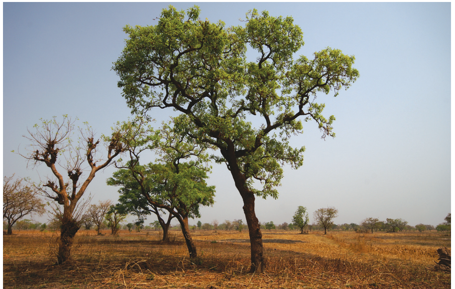
The shea tree, or karité tree, on the savannah in Burkina Faso.

Liquid shea butter is ideal for light formulations and for cold processing while semi-solid butters are better suited for heavier formulations and for fine-tuning the consistency of the formulation. The selection of a shea butter ingredient in a formulation usually depends on the type of formulation, its desired sensory profile and the positioning of the formula in the market.